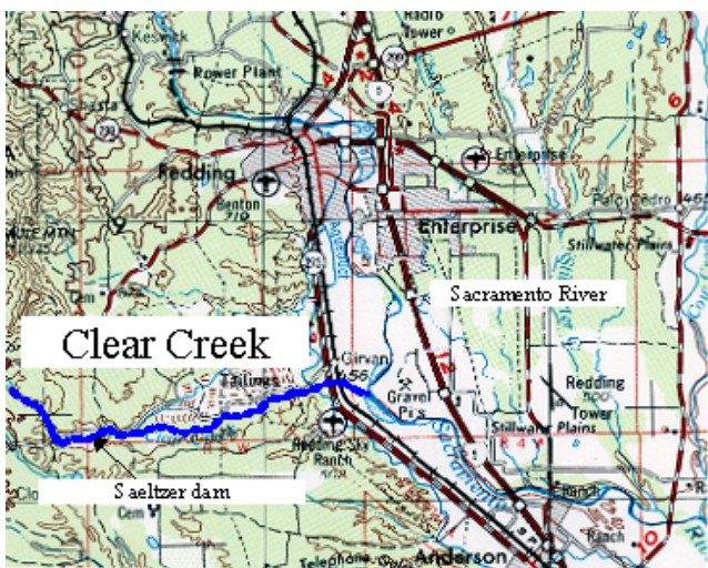
Figure 2: General location of Clear Creek

The project reach is in Shasta County and flows from just below the place where Saeltzer Dam was located, to the mouth of the river into the Sacramento River, in Redding. The reach is about 11 Km. long. (Fig. 2)